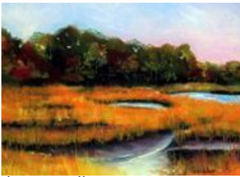
by Pat Pelletier