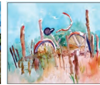
Lonny Hall "Rusty Old Bike"