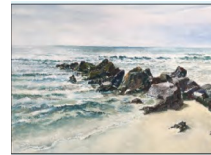
Tom Foster "By the Sea"