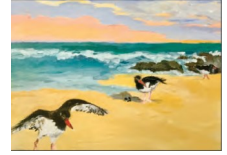
Cathy Falicon "Oyster Catchers"